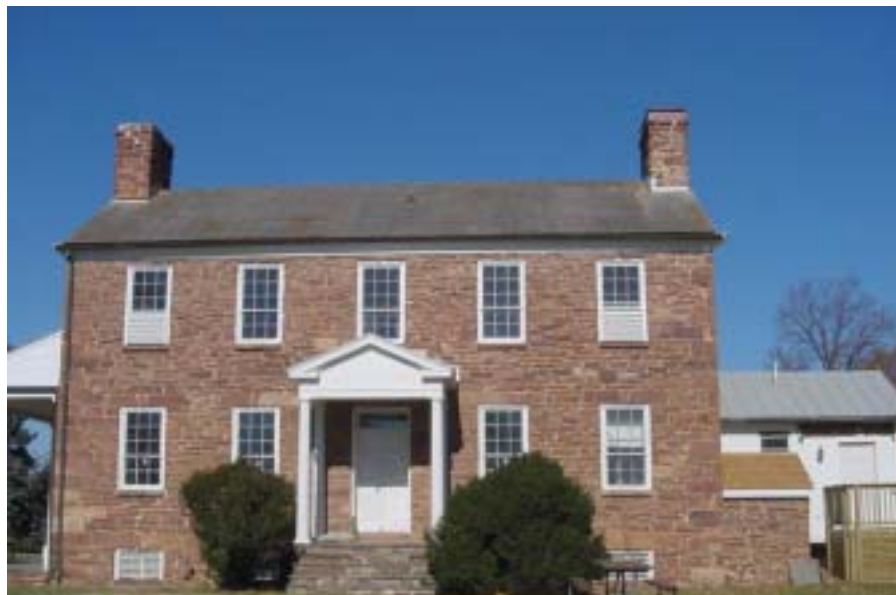
Ben Lomond Manor House