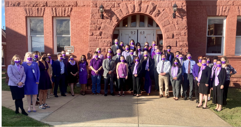
For Domestic Violence Awareness Month, our office wore purple to show our support for those impacted by Domestic Violence.