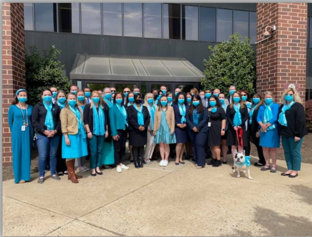
The Commonwealth's Attorney's Office wearing teal in support of Sexual Assault Awareness for the month of April.