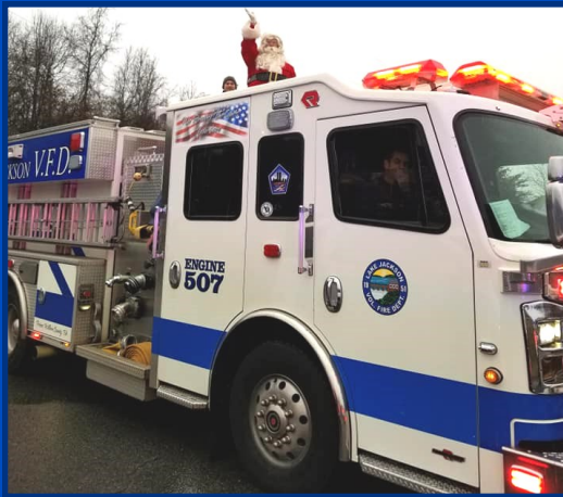
Pancake Breakfast with Santa Lake Jackson VFD (Station 7) December 14, 2019