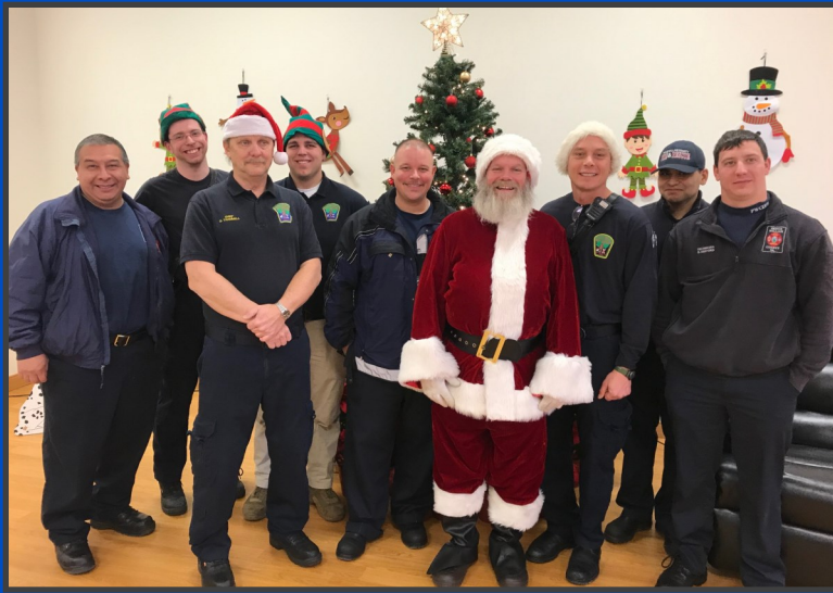
Breakfast with Santa Buckhall VFD (Station 16) December 8, 2019