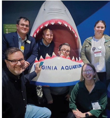
Staff at VAM