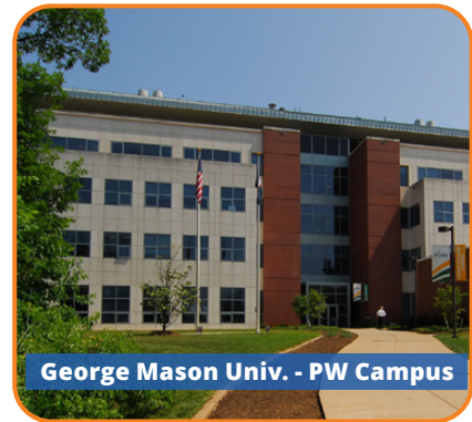
George Mason Univ. - PW Campus