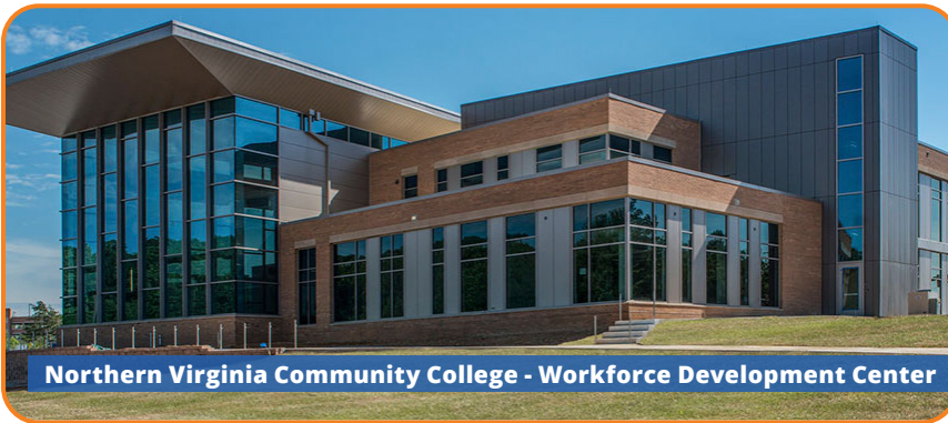
Northern Virginia Community College - Workforce Development Center

Prince William County (PWC) is home to a variety of public and private educational entities, ranging from preschools to universities. While each of these entities contributes to the Quality Education and Workforce Development goal, the public entities have the most direct ties to the County. Prince William County Schools (PWCS), Northern Virginia Community College, and George Mason University each have strategic plans that outline their individual goals for the near future. To maximize the partnerships between the County and these entities, the County's Strategic Plan incorporates outcomes from the various strategic plans that are of most interest to the community at large.