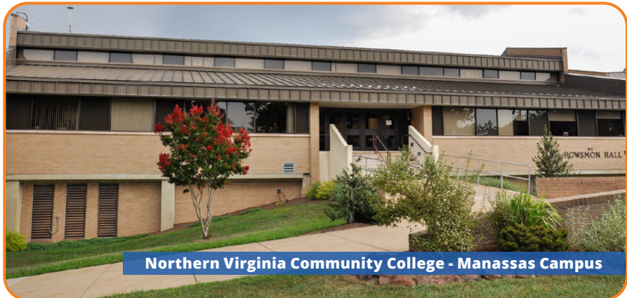
Northern Virginia Community College - Manassas Campus