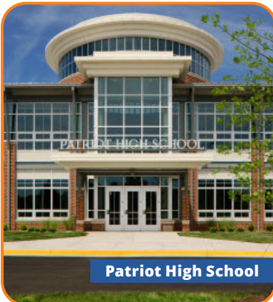
Patriot High School